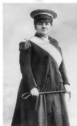
Flora McKinnon Drummond (1878–1949), by unknown photographer, after 1907

Refine: search within your results or reorder by date